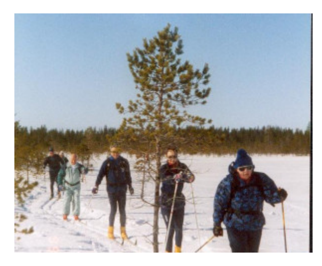
20km safari - £200